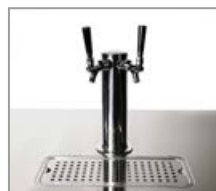
Custom Tap Options