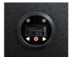
Power Monitor Panel